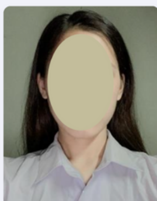
Photo requirements for CMU Student ID Card

Portrait orientation ratio 3:4 with resolution between 900 x 1200 and 1200 x 1600 pixel. File size must be larger than 100 KB but not exceed 1 MB. Image must be in JPG file format. Large file may be failed to upload.