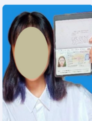
Photo requirements for identity verification

To verify your identity, upload your photo with a passport. Please have the passport on personal information page held next to your face around ear level. It should be noted that the information shown on the passport must be clear and readable. The recommended file size is 1 MB.